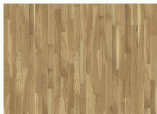
Studio Oak CC 11 mm