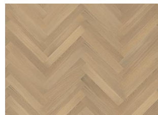
Studio Oak AB White 11 mm