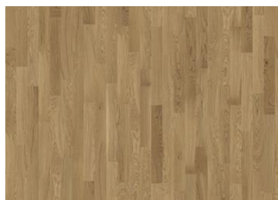
Studio Oak CD 11 mm