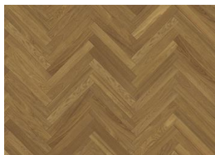
Studio Oak AB 11 mm