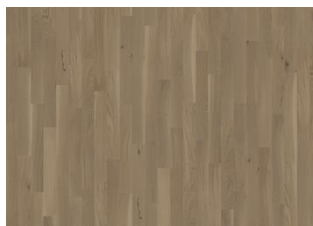
Studio Oak CC 11 mm Grey